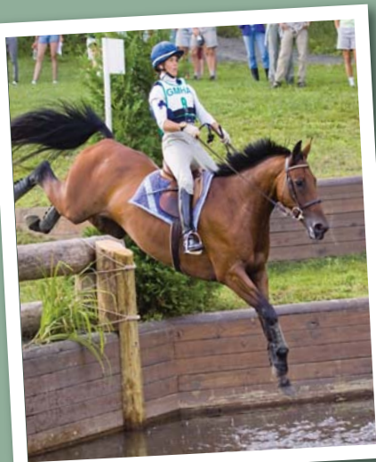
Suzi and Paris Tonight compete over GMHA's Intermediate course.