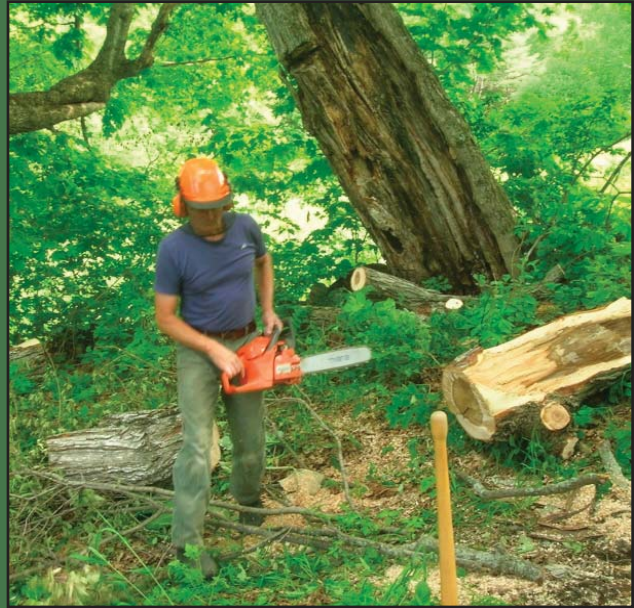
Roy Snell of South Woodstock helps to cut and clear a large maple branch.

As in all things in our busy lives, we are often greatly tempted to assume that someone else will do what needs to be done. When you are out on the trails this summer and fall, enjoying the tranquility of your surroundings and filling your senses with everything good, take a moment to ask yourself: Am I doing my fair share to make this experience possible?