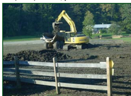
The Upwey Ring is now under construction and scheduled to be completed in time for the Fall Dressage Show.