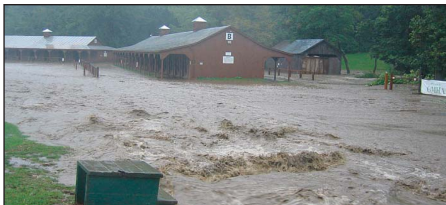
Our brook rerouting itself around C barn towards B Barn and the main parking area.

As many of you know by now, the GMHA grounds were mostly underwater during the storm. Our gentle babbling brook grew to resemble a ranging river, washing away our bridges, rings, porta-potties,