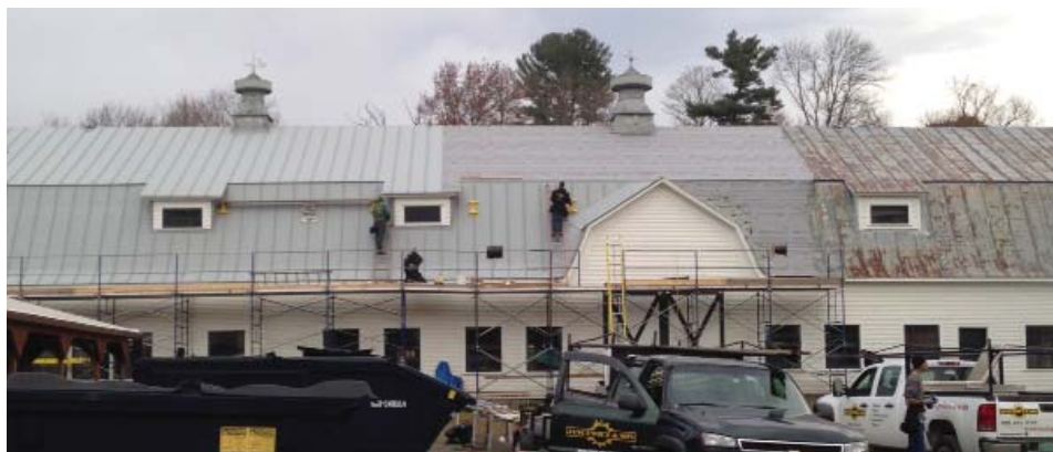
Our roof replacement project is now underway as of November 10, 2015.